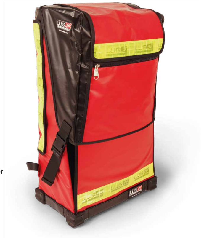
Lateral pocket for single-use cervical collars