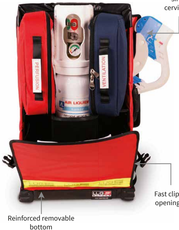
Reinforced removable bottom